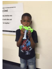
Completed frog craft project. The kids had a blast doing this!