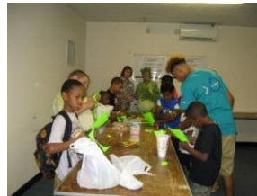
Children working on frog craft.